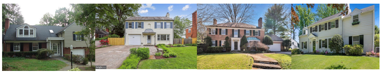
5105 Scarsdale Rd $1,315,000